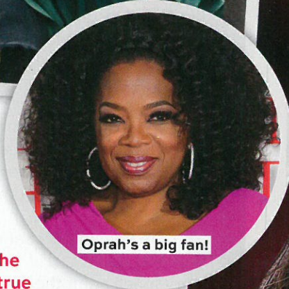
Oprah's a big fan!

bikini all day. The series has already aired in the US. Is it true Oprah tweeted how good you were? Something like that. It doesn't get better than being tweeted by international superstar Oprah though, does it? What's next for you? Is there life after soap, you mean? I hope so. If the right film came along I'd say yes but I've earned a few mortgage payments, so I can afford to be a bit fussy for a while.