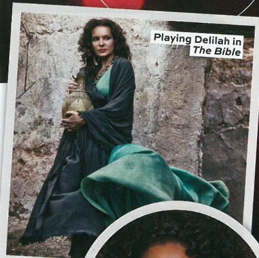
Playing Delilah in The Bible

'They got rid of me. But I'm glad it wasn't my decision'