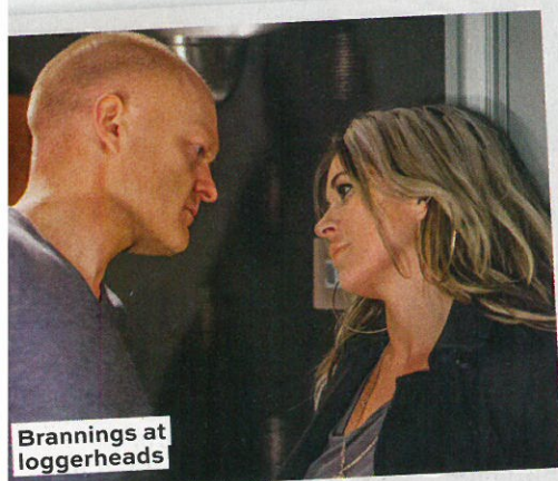
Brannings at loggerheads

[laughs]. But I'm glad it wasn't my decision because you don't worry about things you can't control. But I'll always be very thankful. Have you finished filming all your scenes? No. I will still be on screen until the beginning of January.